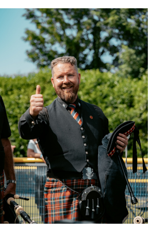
< HAMPSHIRE CALEDONIAN (ENGLAND) FOR BEST DRUM CORPS