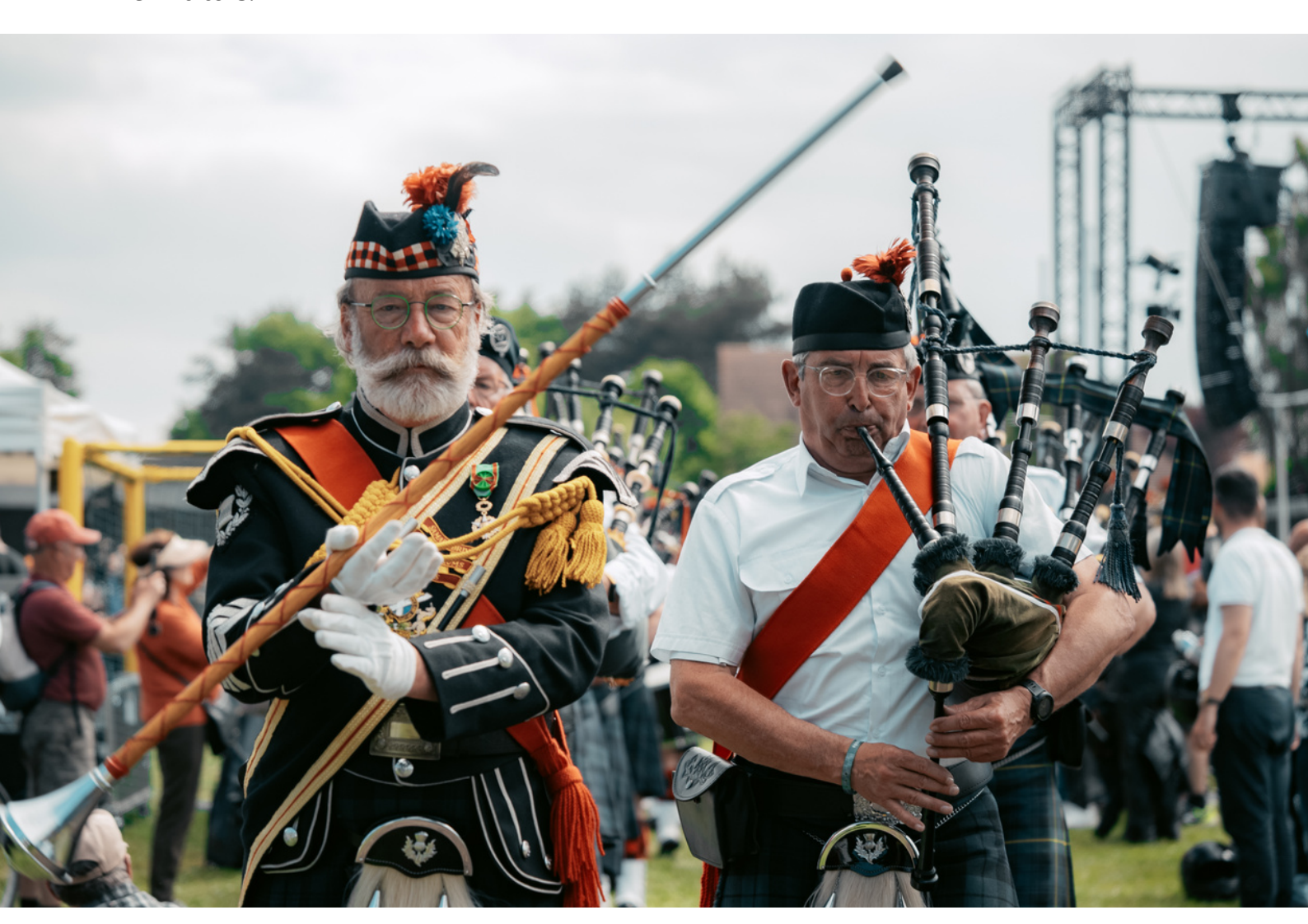
The Samarobriva Pipes & Drums Band at the D-Day Normandy Cup

More than 7,000 visitors attended this first edition, which delighted festival-goers, including many military personnel, fans of Celtic music, as well as all partners and exhibitors.