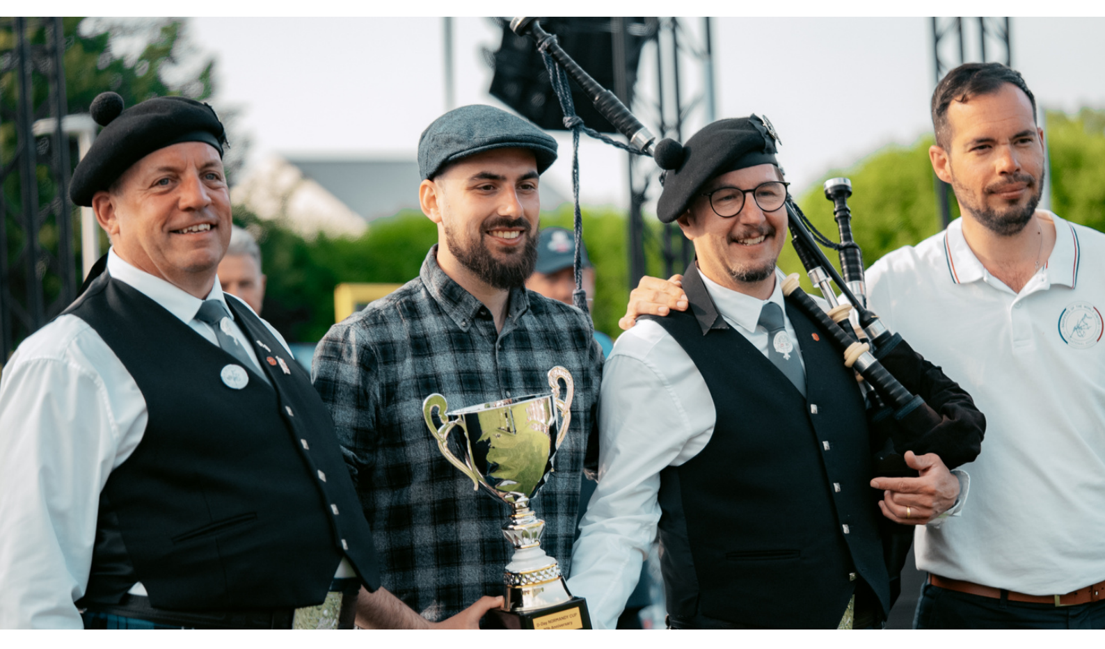
^ 3 LAKES UNITED (SWITZERLAND) IN THE PIPE BAND CATEGORY

Congratulations to the winners of the various competitions: